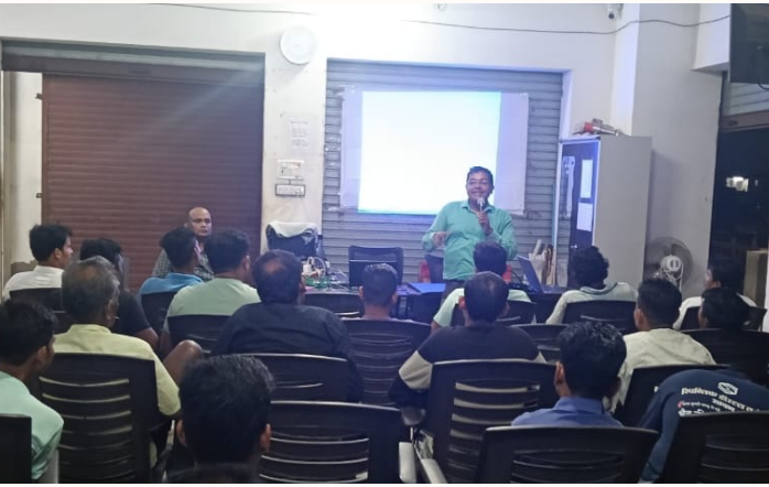
Financial literacy session, May 2025