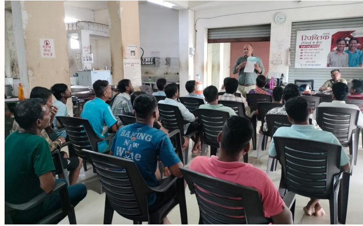
Occupational safety & health workshop, Aug 2025